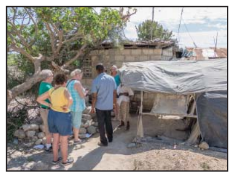
Ministering to the impoverished elderly in Jacmel