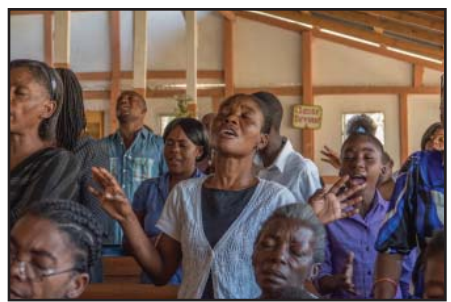
Evangelical Lutheran Church Jacmel - praise & worship!

I was so happy to be in Haiti again. The weather was wonderful as it always is plus my arthritis pain disappeared immediately. The country seemed to be a little cleaner and we saw way more animals than we have ever seen in past trips. Also, Haiti is in a big controversy over their election of a new leader. Noth-