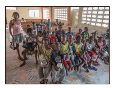
Feeding program at Beaudouin tent city